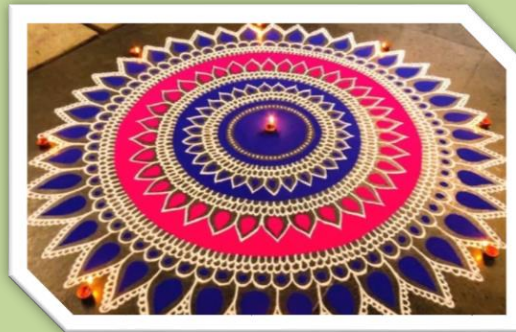
By Miss. Pragati 8 th Sem EEE AITM