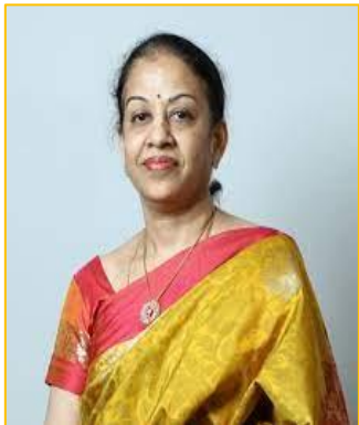
Smt. Mangal Suresh Angadi Hon'ble MP & Chairperson SAEF