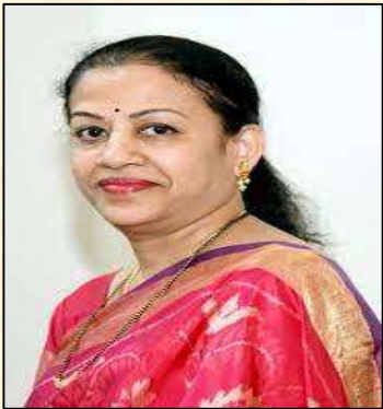
Smt. Mangal Suresh Angadi Hon'ble MP & Chairperson SAEF